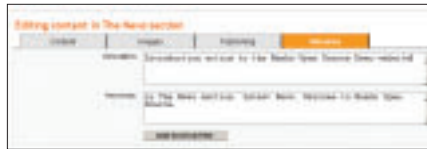
Figure 4: Changing the metadata

Many web site visitors will use the search facility on your site to jump directly to the information they want. But did they find it? You’ll never know. Mambo OS has the option to log all searches and the results provided. This search logging is a great way of determining what your customers are looking for and perhaps identifying gaps in your product range or information.