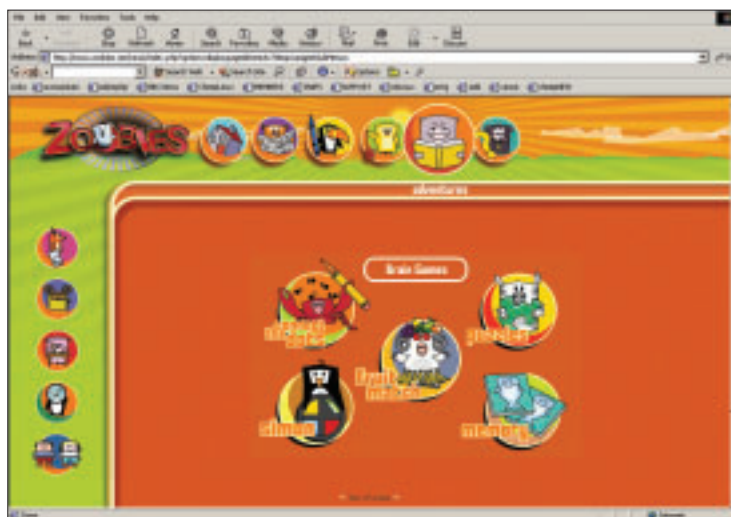
Figure 1: The Zoobies site showing a different look

Mambo OS does the hard stuff, freeing you to concentrate on the content.